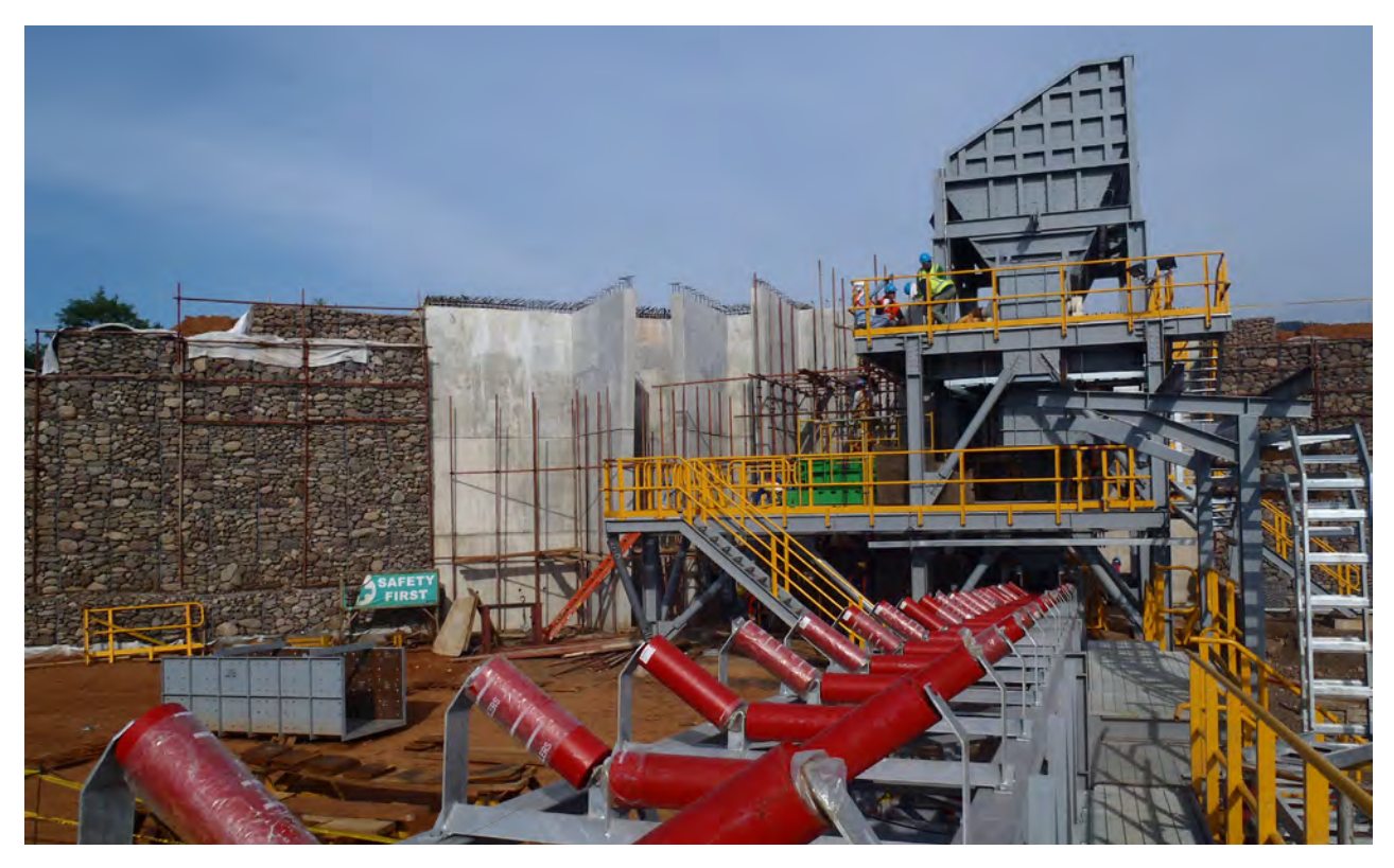
ROM bin, crusher station and discharge conveyor to surge bin.