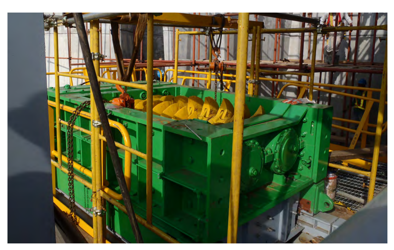
Primary rolls crusher, specifically chosen to handle wet ore.