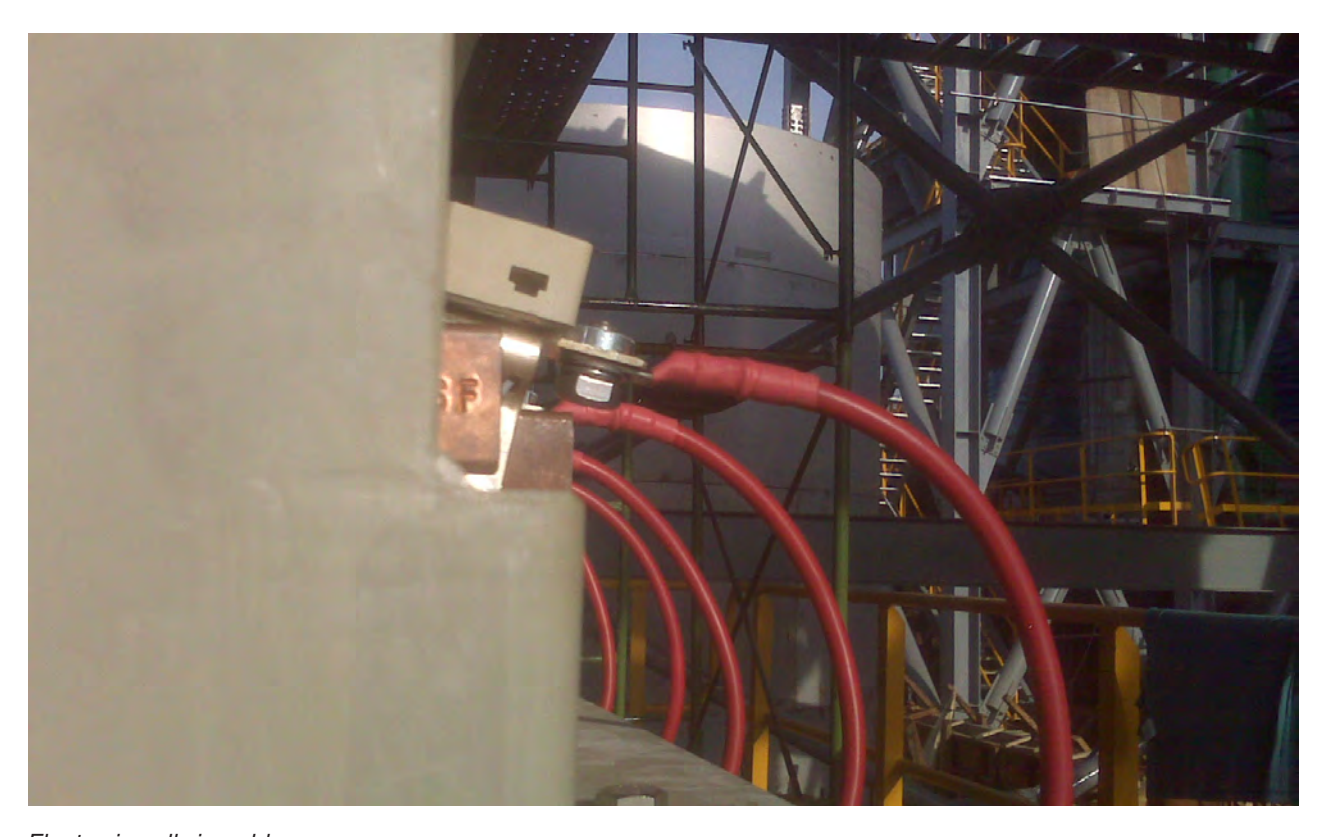
Electowin cells in gold room.