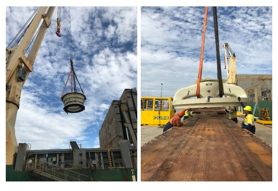
Figure 3: The first of the crusher components have now arrived at Fremantle.

The main components of the crusher (shell, spider and main shaft) have been delivered to site, with all remaining components on schedule for delivery by the end of the June Quarter 2021.