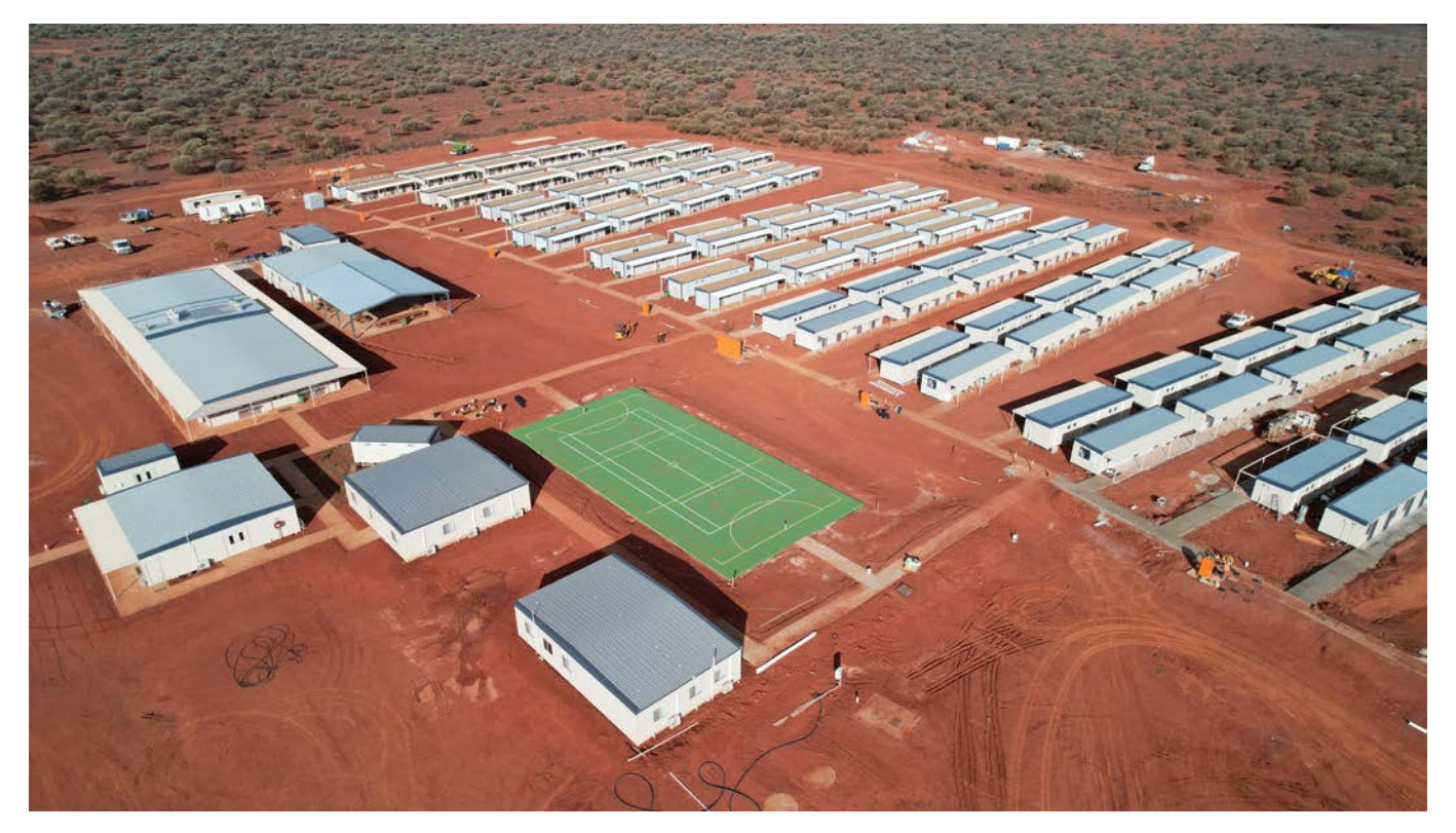
Figure 4: KOTH Village nearing completion.

The village is operational with between 130 to 150 residents on-site in April 2021. The construction of the village is complete, with landscaping, pathways and the final two single-persons quarters to be installed and completed.