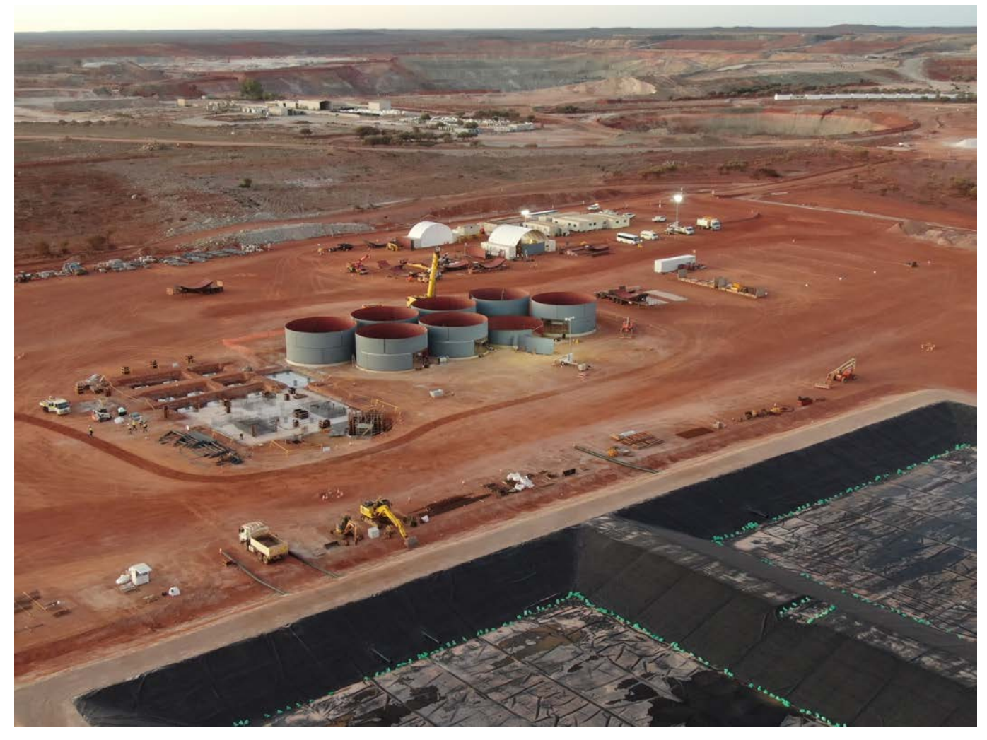
Figure 1: Aerial view of current progress at the processing plant.

Bulk earthworks at the process plant are complete and the plant administration buildings have been installed. The process and raw water ponds are complete and have been lined. The CIL tank ring foundations are complete and erection of the CIL tanks is well underway. The Mill foundation raft was poured on 29 April 2021 with 760 cubic metres of concrete, being the largest single concrete pour of the Project.