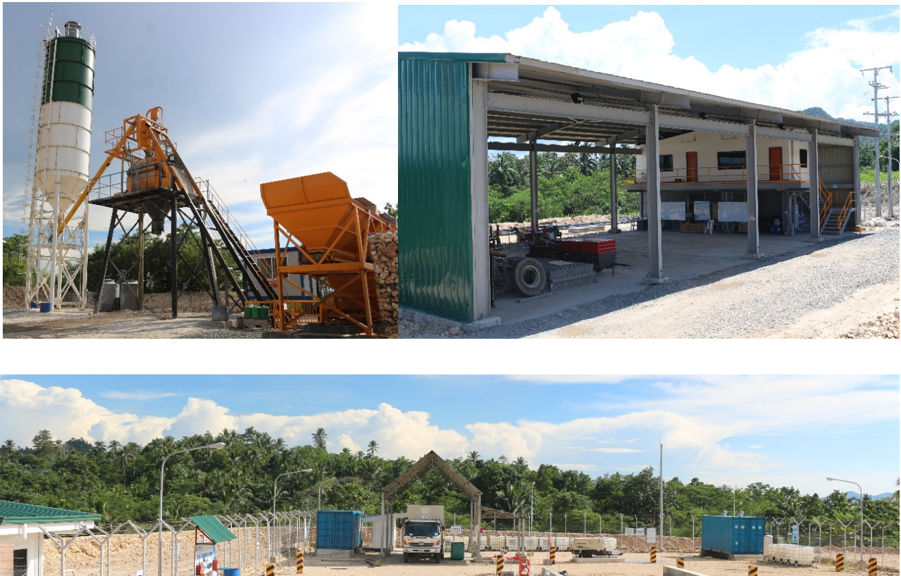
Figures 2, 3 and 4: Underground batching plant (top left), heavy vehicle workshop (top right) and bulk emulsion depot (bottom)

Construction of important surface infrastructure, namely the bulk emulsion depot, underground batching plant and heavy vehicle workshop (see Figures 2, 3 and 4 below), was completed prior to the suspension of operations at Siana.