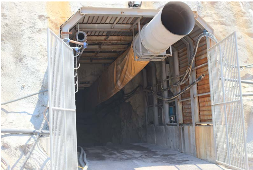
Figure 5: Portal to Main Access Decline

Refer to the Red 5 announcement dated 14 June 2016 for further details of the underground mine development and Feasibility Study assumptions.