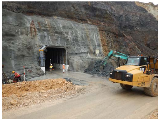
Figures 1 and 2: Portal construction at the Siana Underground Mine

The status of the following construction projects as at the end of the Quarter was as follows: