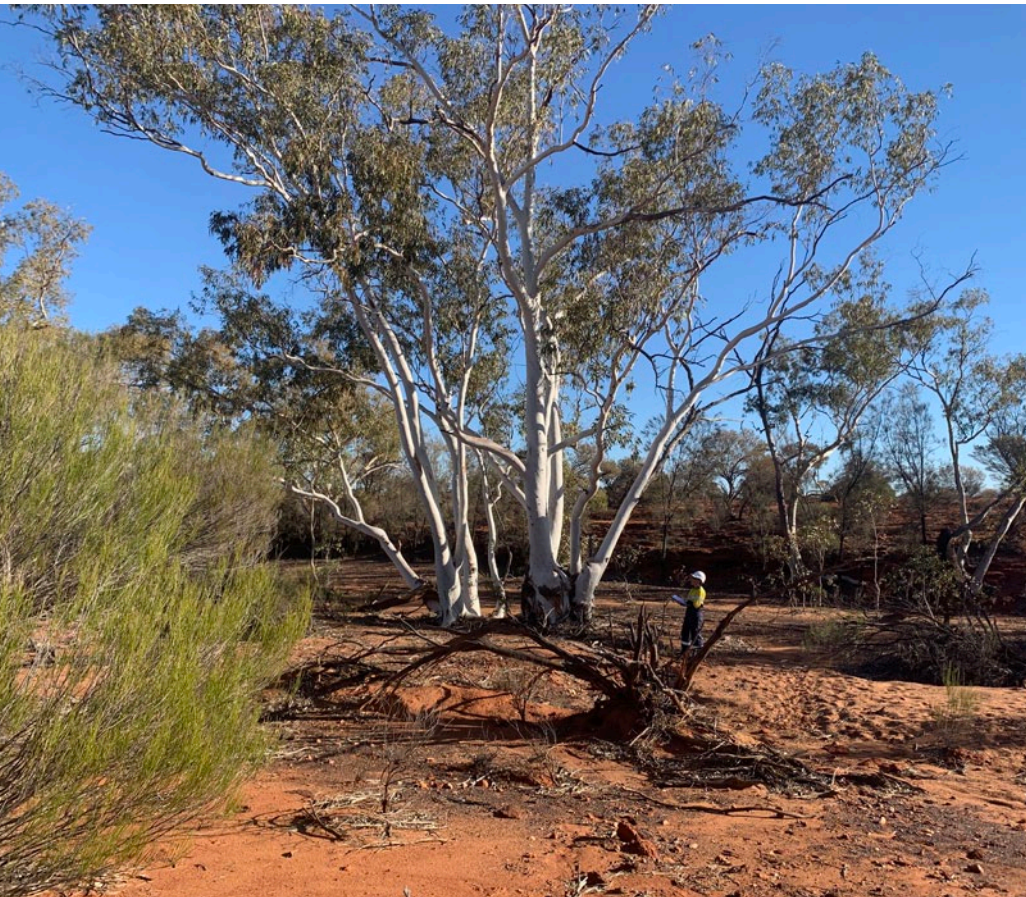
Sullivan Creek at KOTH, an important feature for the local traditional owners.

Sullivan Creek, to the west of our KOTH operation, is a site of significant importance to the traditional owners. The KOTH operation required the construction of a gas lateral spur pipeline from the main Goldfields Gas Pipeline at KOTH. This gas lateral crossed Sullivan Creek. To avoid any potential disturbance to the creek bed and banks, including a 100m buffer either side of the creek, horizontal directional drilling was used to allow the pipeline to pass beneath the creek and buffer zone with no surface impact. Traditional owner representatives were engaged to oversee and advise this process.