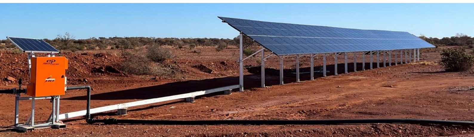
Borefield powered by a solar array.