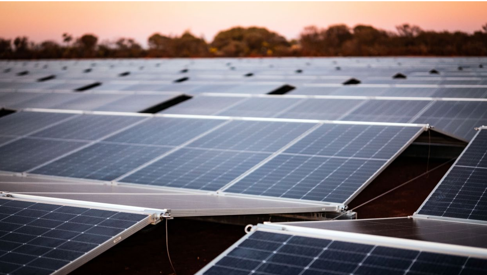
Solar farm at KOTH providing 2MW to the operation.

Power for the KOTH operation is sourced from an onsite hybrid gas-solar power station. This has significantly reduced the operation's carbon footprint relative to a diesel fuelled power generation alternative. The installation includes a 2MW solar farm and solar arrays to power some production bores which further reduces the operation's carbon emissions.