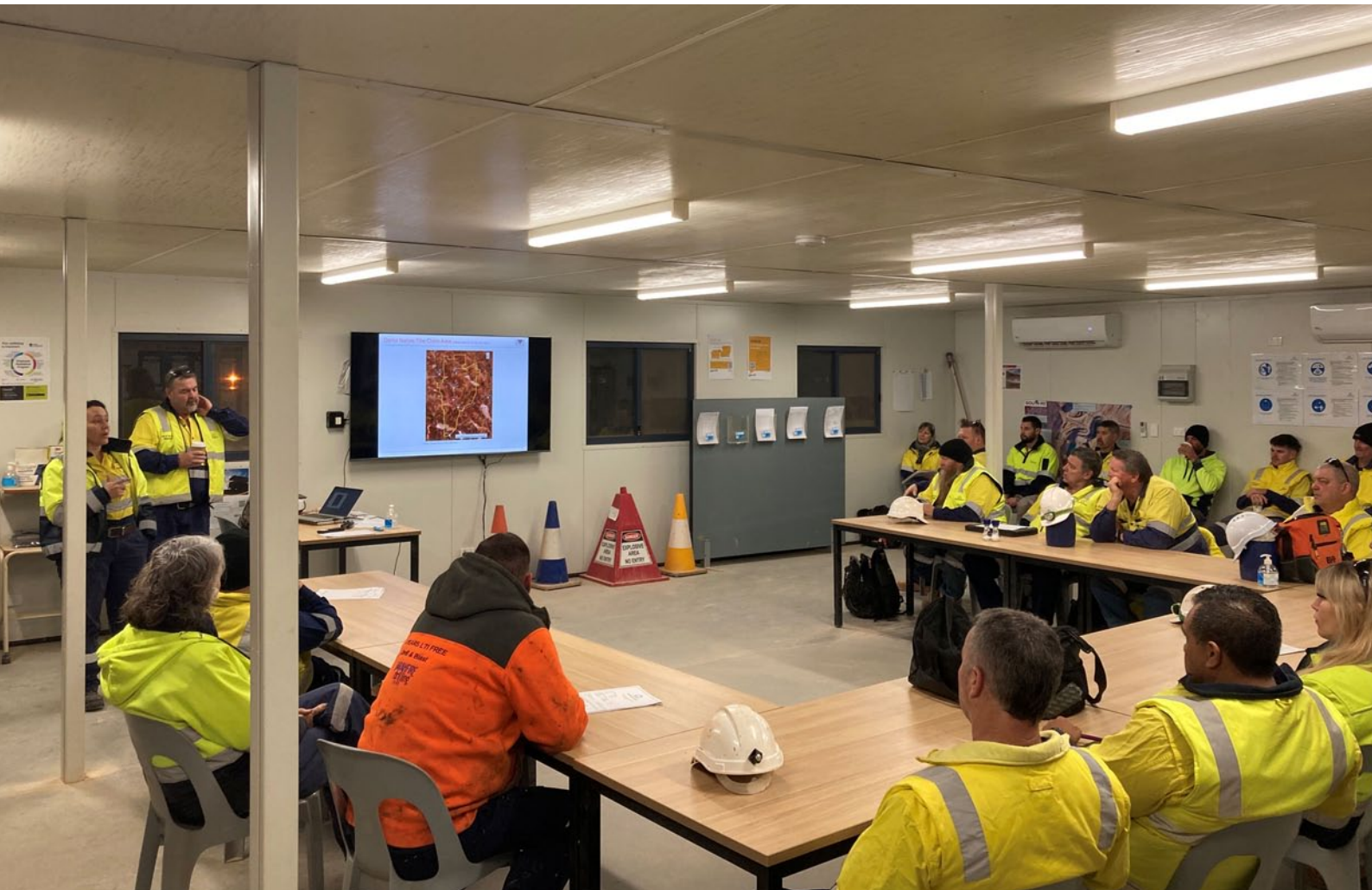
Cultural awareness training at KOTH.

planning process to avoid impact on these sites and protecting them for the future. A cultural heritage awareness program was rolled out across all operations at both KOTH and Darlot in FY22 and will continue into FY23.